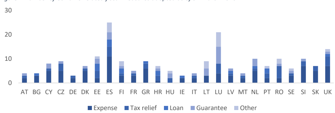
Figure 1 Number of Covid-19 related fiscal measures adopted as of 31 March 2020

Tax relief measures achieve similar objectives by reducing the immediate tax burden for taxpayers. Nearly all countries have postponed tax deadlines (24 countries). measures delay receipt of part of the tax revenues, but at the same time it is expected that the large majority of the amounts due will ultimately be paid. Moreover, there are also nine countries that have introduced tax waivers for