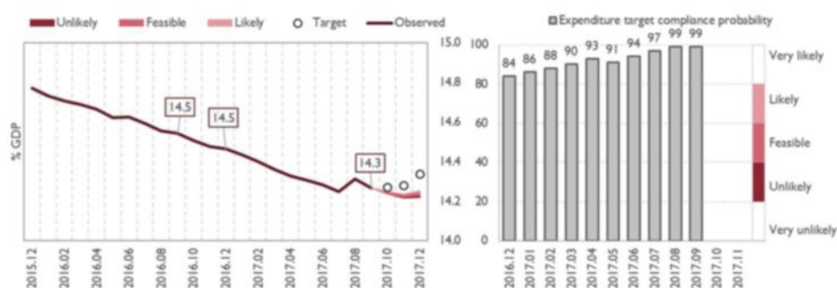
GRAPH 3 NON-FINANCIAL EXPENDITURE