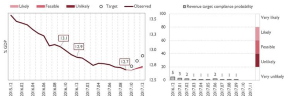
GRAPH 2. NON-FINANCIAL REVENUE